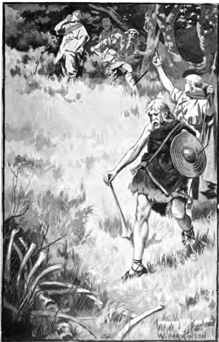
THEY DISCOVER AN ANCIENT MONSTER